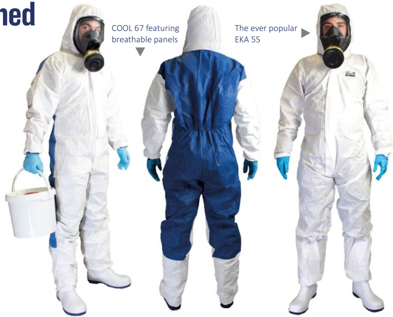
COOL 67 featuring breathable panels